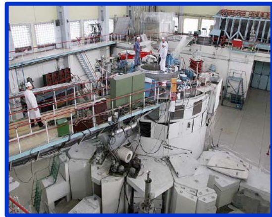
Fig.2 Central hall

The reactor is equipped with hydraulic tube, pneumatic tube, universal loop facility, the installation of neutron radiography, facility for the analysis of uranium containing samples by delayed neutron technique, in-core installations for testing of construction materials for the long-term strength and creep, a chain of hot cells for work with highly active materials.