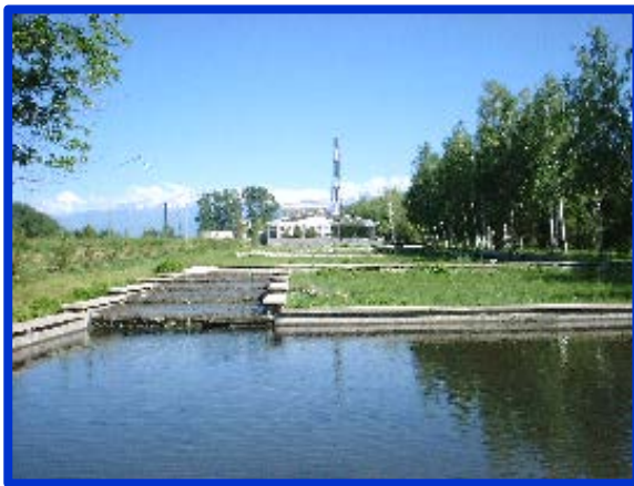
Fig.1. Front view

In addition to fundamental nuclear physical and materials scientific researches and in-situ tests, the reactor is used for production of medical and industries radioisotopes and neutron activation analysis.